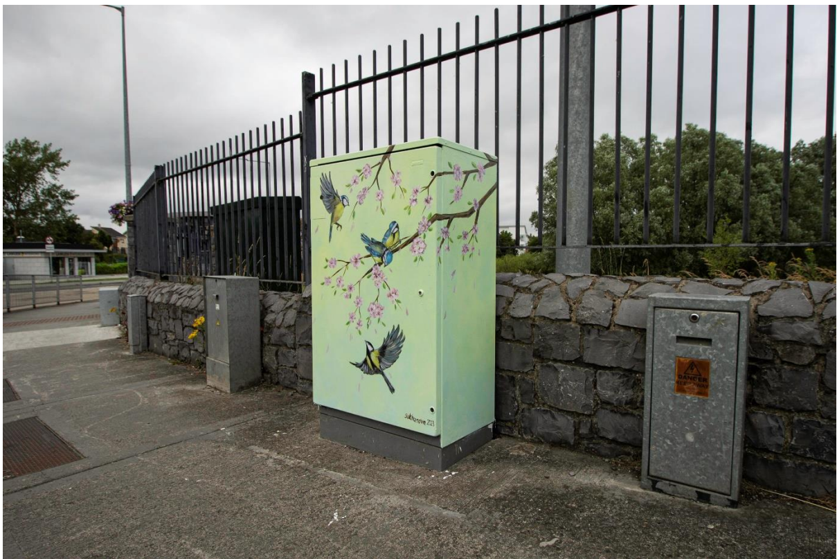
'Spring' by Svitlana Sukhanova. Main Street, Church Road, Mulhuddart, Co. Dublin.