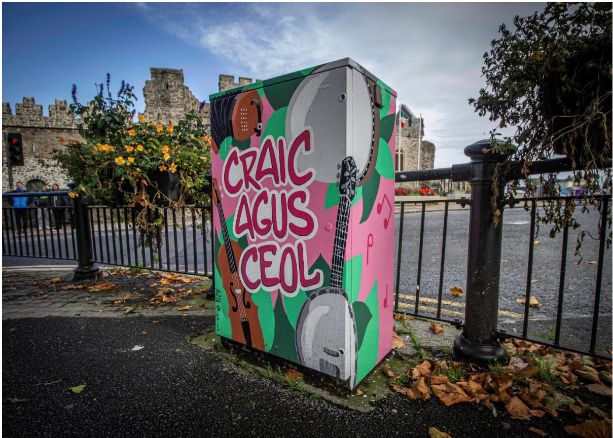
'Craic agus Ceol' by Aj Higgins. Bridge Street, Swords Main Street, Swords, Dublin.