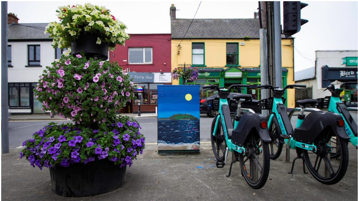
'Lambay' by Amelie Bates. Main Street/Skerries Road, Rush, North County Dublin.