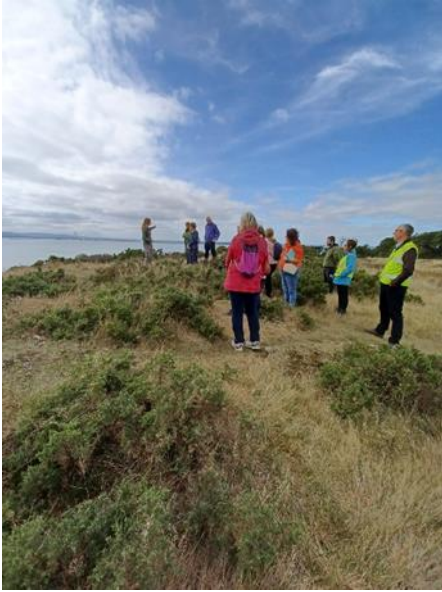
'Meet the Goats at Howth Head' walk and talk event as part of DCAW22