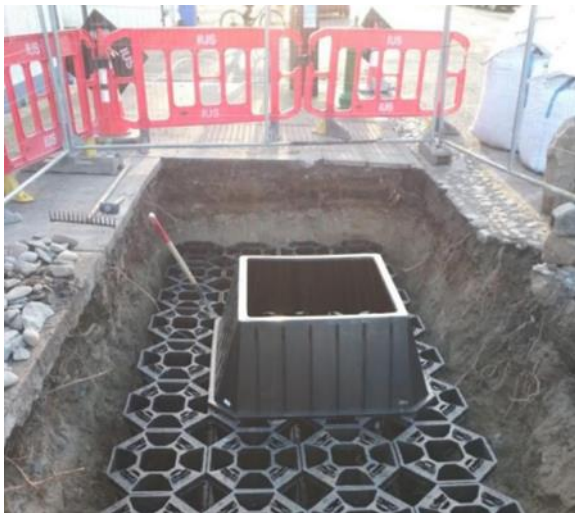
Tree pit under construction at Strand Street, Skerries

The Council continues to implement SuDS measure on new projects. Seven constructed tree pits were integrated on Church Street Skerries in March 2022 to replace trees removed during 2019 & 2020. The new tree pits offer the added advantage of an improved drainage function. Permeable paving has been incorporated on a new 90 space car park for the Ward River Recreational Hub.