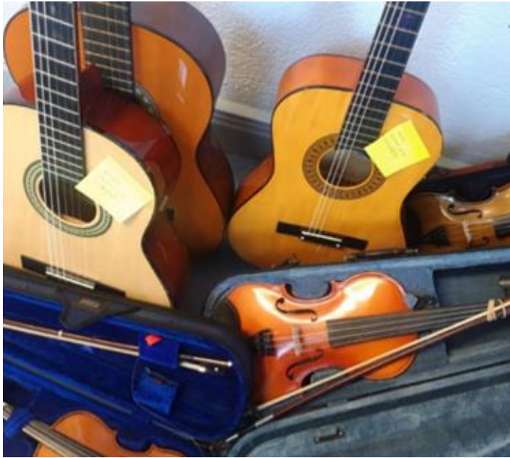
Musical Instruments donated to St. Margarets National School