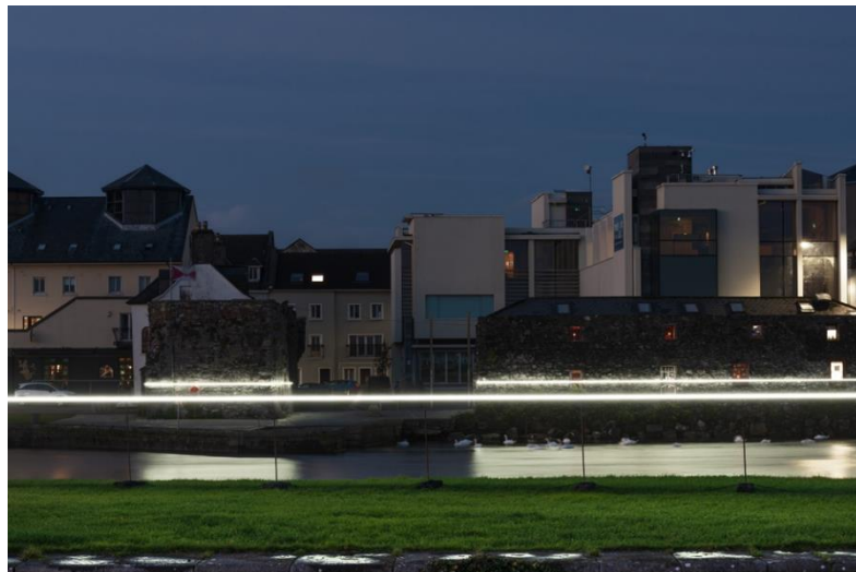
Image 1: Línte Na Farraiqe installation by Pekka Nittyrvita and Timo Aho – Galway, September 2022.

Changing behaviour and empowering local adaptation. CARO have worked with artists, a number of local authorities, academia and other partners on the Creative Climate Action Funded project ‘Línte na Farraiqe’ 6 . It consists of a series of LED light art installations at coastal locations to visualise sea level rise and storm surge. Communication tools such as a website, information boards and a social media campaign have been devised to engage the public on climate action. The project launched in September 2022 with an installation in the Spanish Arch Galway (see image 1 below) and Wexford Promenade in October. A further installation may be completed in Dublin in early 2023.