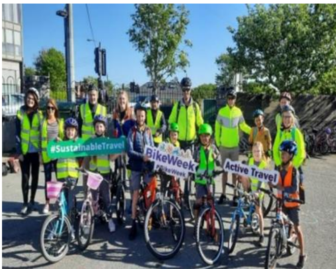
Launch of Portmarnock Cycle Bus

The sum of these actions will encourage a modal shift away from private cars to more sustainable alternatives. This will ultimately result in a reduction in the number of journeys taken by car, taking cars off the roads, reducing congestion and emissions across the County.