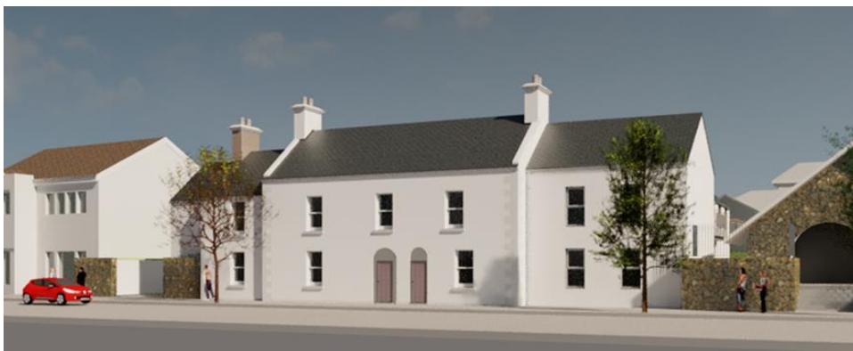
Proposed Housing Development North Street Swords