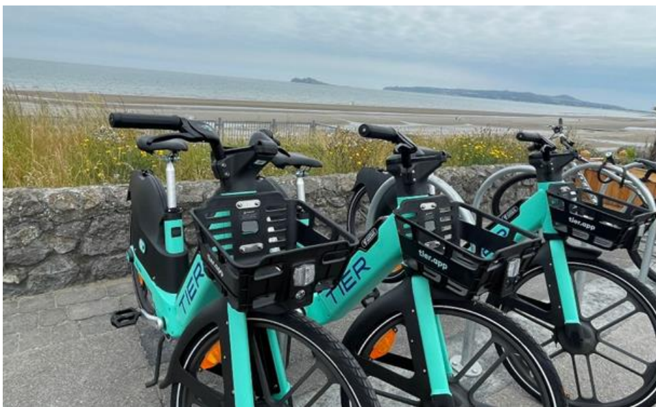
Tier ebikes available for coastal tours