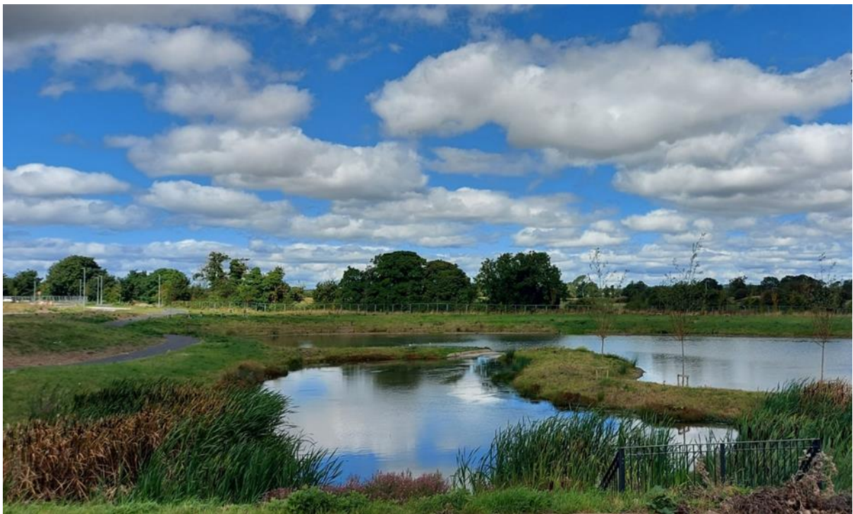
Detention Pond at Millers Glen, Swords that forms part of the Ward River Green corridor.