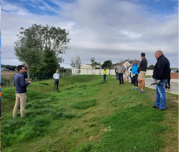
Similar walk and talk event as part of DCAW21 at Castleway & Haxelbrook, Malahide