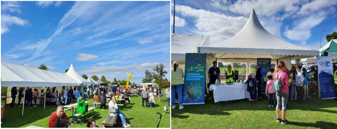
Mini Climate Festival at Millennium Park for DCAW22