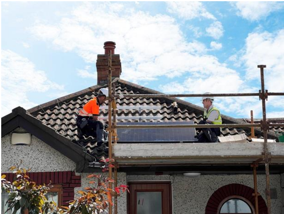
Solar PV being installed on Social Housing