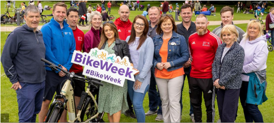
Fingal's Active Travel Team with the Chief Executive at Bike Week Family Fun Day