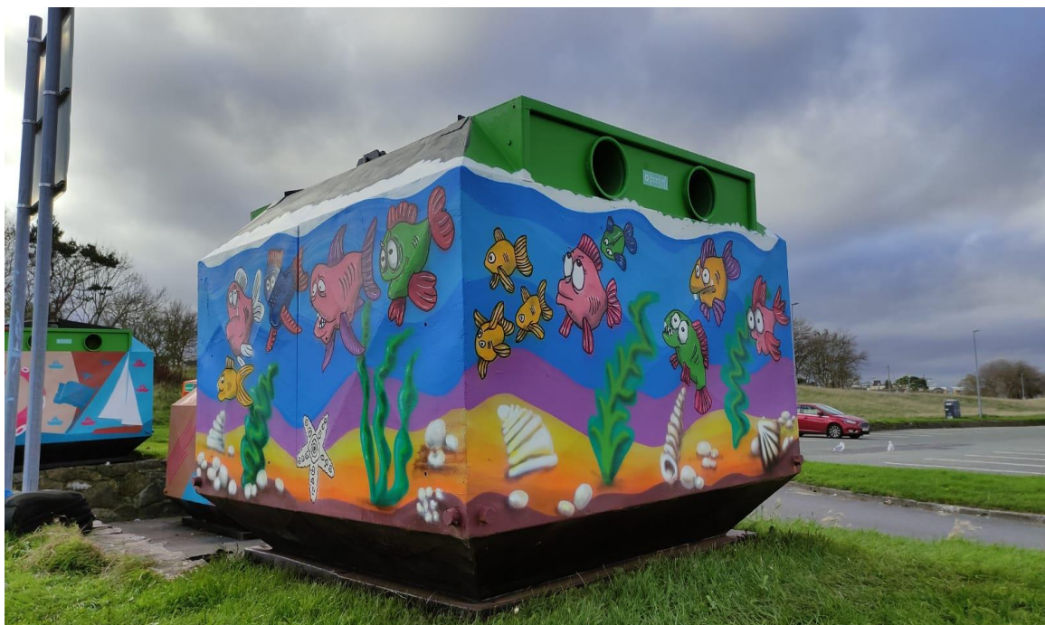
Anti-Graffiti artwork at bottle bank site