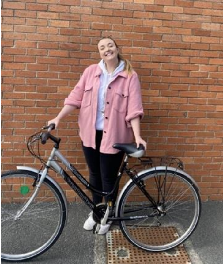
Teacher at St Laurences School receives a repaired bicycle