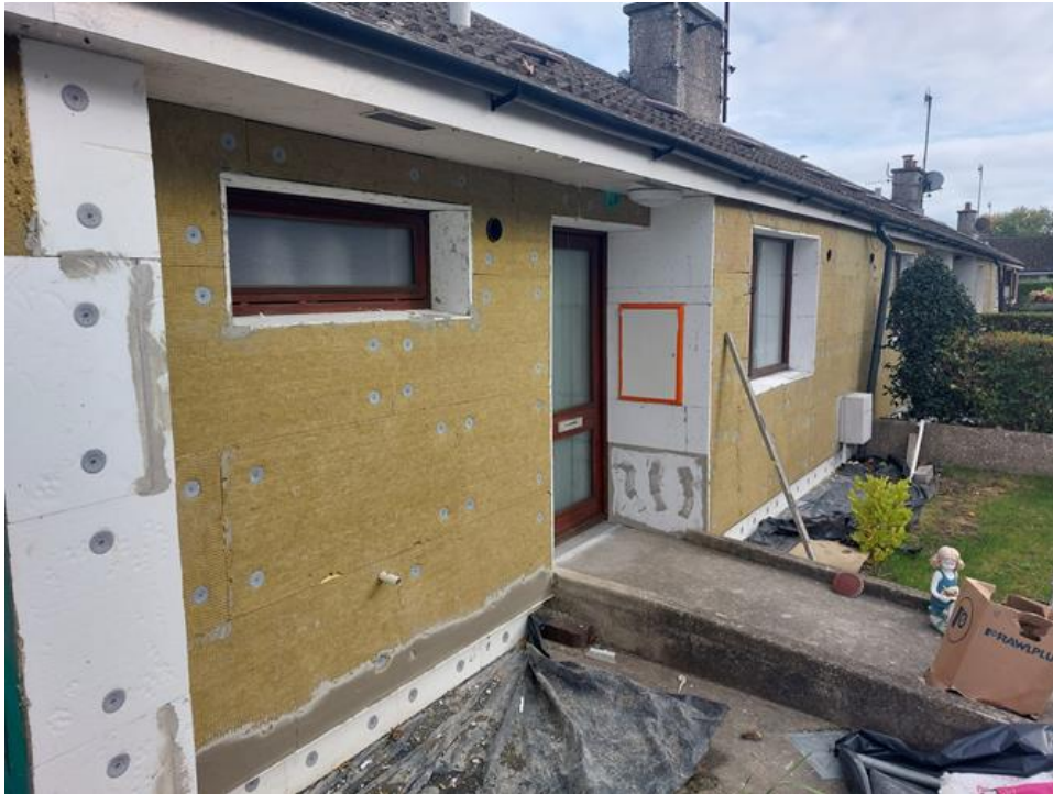
External Wrap Insulation installed on a Social Home before external render applied.