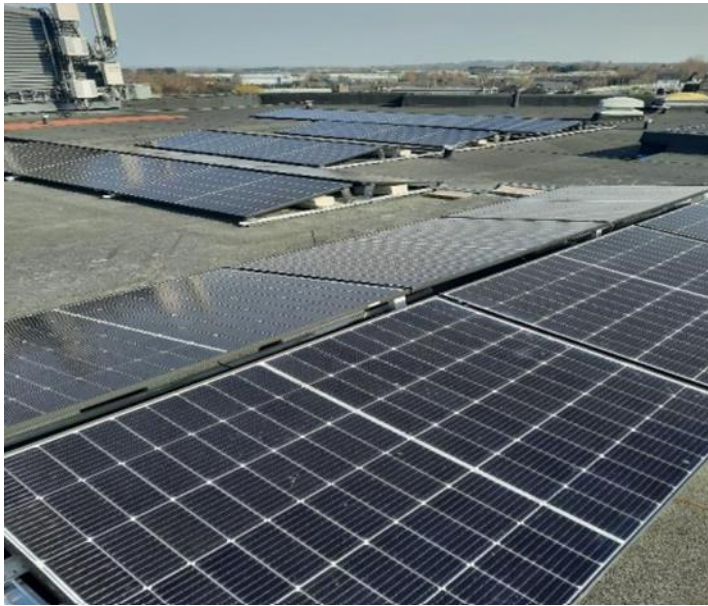
Solar PV installed on the roof at County Hall Swords

A number of Energy Awareness webinars were hosted by Codema for Dublin Climate Action Week, including a webinar focusing on saving energy in the home. Recordings are available at https://dublinclimatechange.codema.ie/climate-action-week/event-resources/