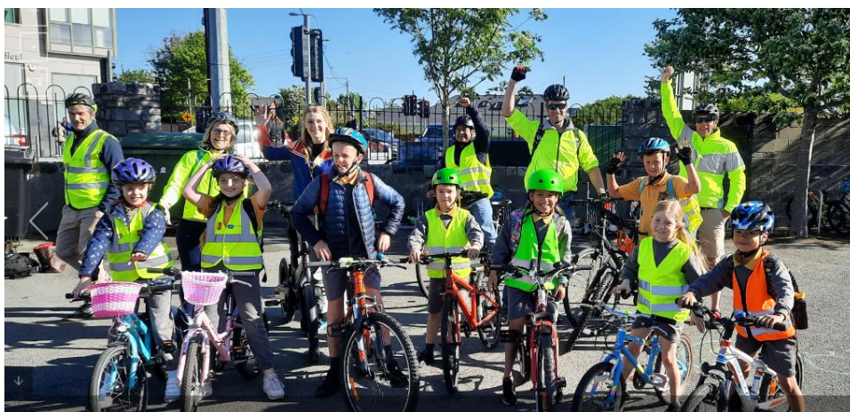
Cycle Bus arrives at St. Marnock's National School