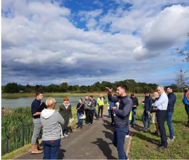
Staff from Planning & Strategic Infrastructure Department delivering an 'Urban Planning & Nature Based Surface Water Management' walk and talk event as part of DCAW22 at Millers Glen, Swords