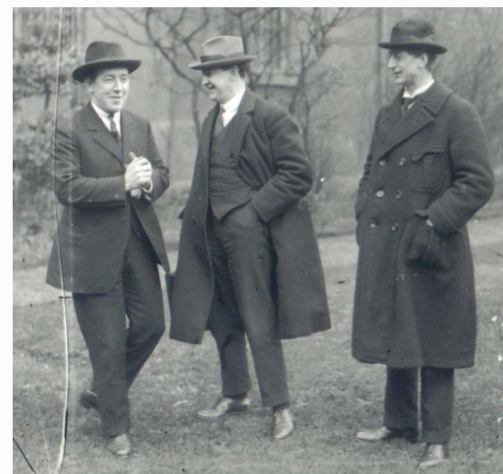
Harry Boland, Michael Collins and Éamon De Valera