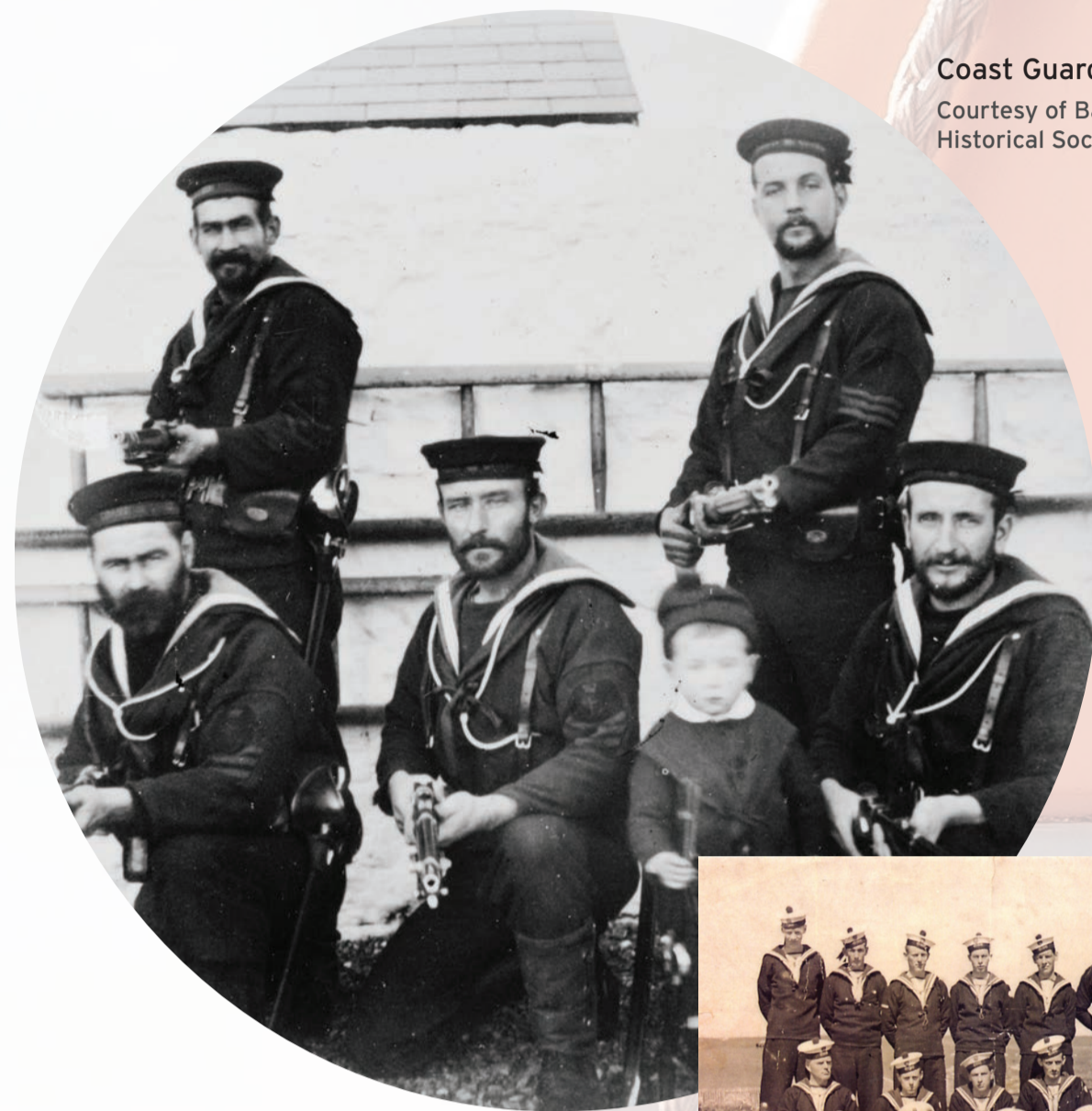
Coast Guards, Balbriggan 1890s