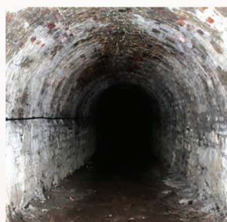
Tunnel at Casino, Marino