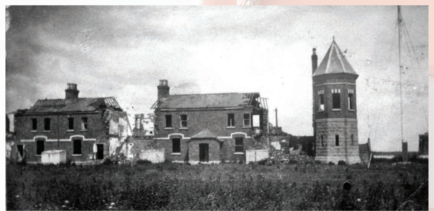
Ruins of the Balbriggan Coast Guard Station 1923

The following day, the newspapers carried headlines telling of "Coastguard Stations Destroyed", "Co. Dublin Sensation" and "Dublin Coast Afire". It was reported that those arriving into Amiens Street Station (now Connolly Station) the following morning had seen fires all down the North Dublin coast. But all reports pointed out that the raiders were courteous in dealing with the guards and their families. An Evening Herald reporter summed it up when he noted that the raiders were "courteous but firm".