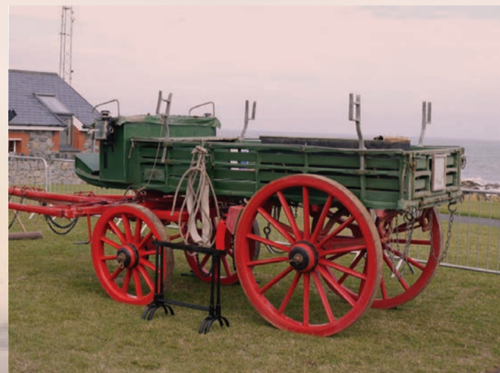
Skerries Rocket Cart The Rocket Cart is a lifesaving apparatus. A rocket was used to shoot a light rope onto a ship in distress. This rope was then used to pull heavier ropes and equipment onto the ship. The Rocket Cart contained a supply of lifesaving equipment and was usually horse-drawn. The Skerries Rocket Cart is currently on loan to Fingal County Council.

During the War of Independence (1919-1921), many of the Coast Guard stations were destroyed. They were looked upon as being part of the British administration and therefore legitimate targets. The Guards and their families were evacuated to Britain. After the signing of the Anglo-Irish Treaty in late 1921, the Coast Guard and its 109 stations were handed over to the Irish Free State becoming known as the Coast Life Saving Service. Many of the stations which had been badly damaged were not re-built while others were converted to private residences. Over the intervening decades, there were several name changes - The Coast and Cliff Rescue Service and The Irish Marine Emergency Service - eventually becoming known in 2000 as the Irish Coast Guard.