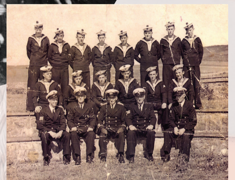
Coast Guards, Howth 1910s