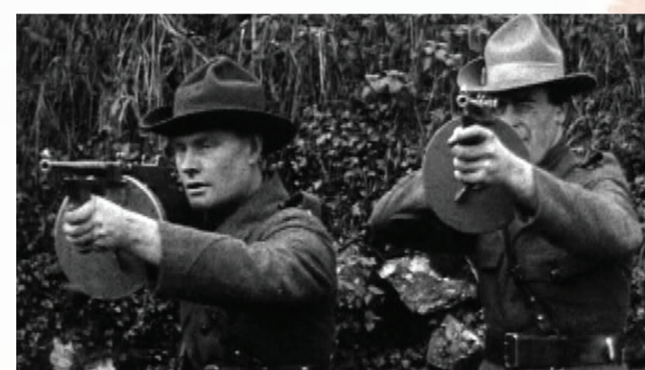
IRA practice with Thompson Machine Guns 1921