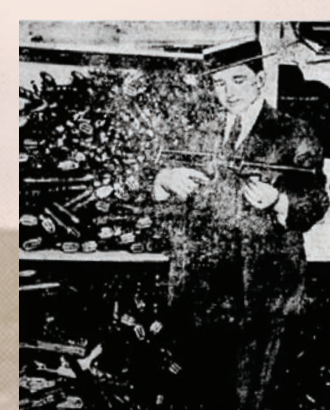
Detective Beauty of the Hoboken police with some of the seized guns 1921 Montrose Daily Press 1 July 1921

Despite the destruction of the Coast Guard Stations going smoothly, fate intervened when, due to a worker's strike, the East Side ended up stuck at Hoboken, New Jersey. Although the freighter was supplied with an Irish crew to get it underway, a non-Irish crew member became suspicious of heavy sacks that were being loaded onto the ship. Upon opening one of the sacks he saw a gun barrel and immediately contacted the police, who, along with the FBI, raided the freighter on 15 June 1921. Police records show 13 sacks containing 105 unpacked Thompson machine guns, 495 packed machine guns, 289 large boxes of magazines, one small case of cartridges and 175 small boxes thought to contain small arms were seized. News of the police raid did not reach Ireland until well after the attacks on the Coast Guard stations and the men in the Fingal and Eastern Brigades were greatly disappointed, with Seamus Finn noting that it "knocked the bottom" out of them. The guns were impounded by the New York Police Department pending trial. All of those taken to court either had the charges dropped against them or were found not guilty, as the relevant export documentation had lapsed. After much bureaucratic wrangling the guns were eventually returned to their owners and arrived in Ireland in 1925.