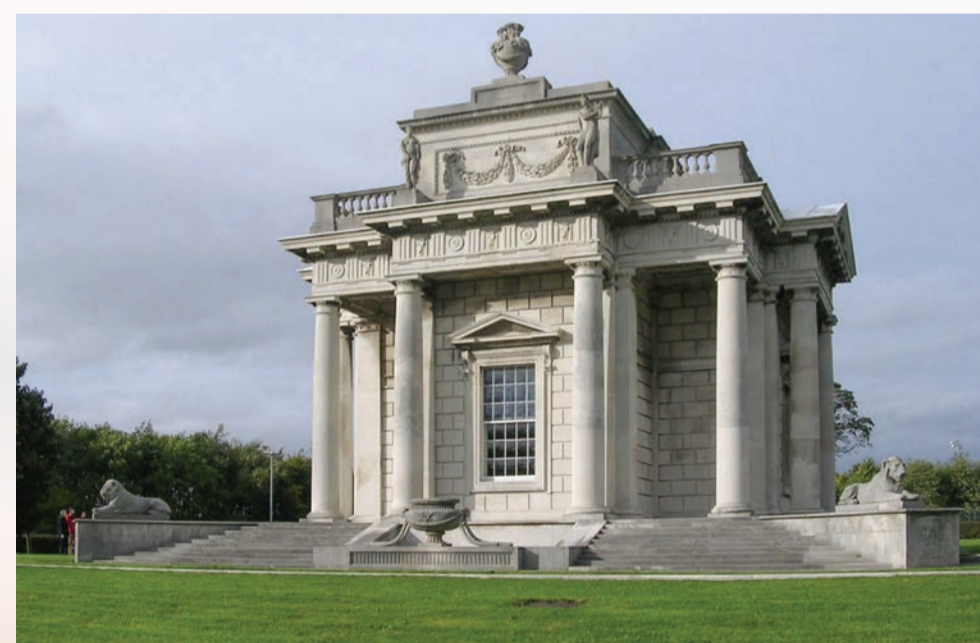
Casino at Marino

By May 1921, small quantities of the gun had reached Ireland, along with two former U.S. Army officers who trained the IRA in their use. They were tested for the first time in the tunnel under the Casino at Marino before a select audience of IRA men including Michael Collins and Richard Mulcahy. Their first use in combat in Ireland was on 16 June 1921, when a train carrying British troops was ambushed at Drumcondra railway station. Three soldiers were injured and newspapers reported that the train carriages were "riddled with bullet holes".