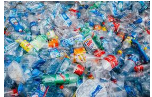
We need to recycle. All of these bottles were picked on a beach.