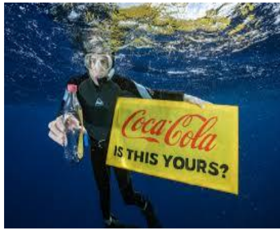
How did this bottle end up in the ocean