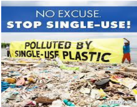
To stop scenes like this we all need to do better.