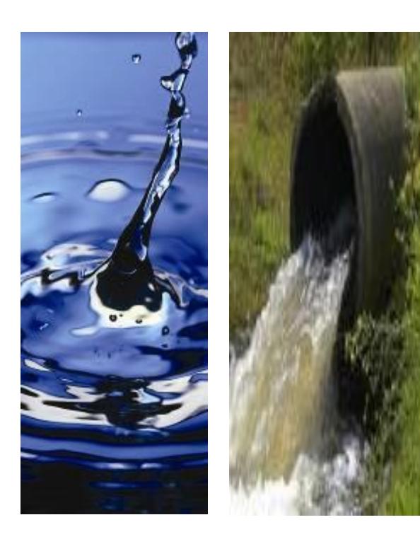
Application for a Licence to Discharge to Surface Waters