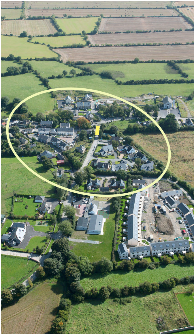
Above: Aerial view of the village.. The circled area indicates the traditional village core. The River Daws flows under the bridge, outlined in yellow, and between the trees. The housing scheme in the foreground is for social and affordable housing. This image was taken in September 2009. The scheme was completed shortly afterwards.