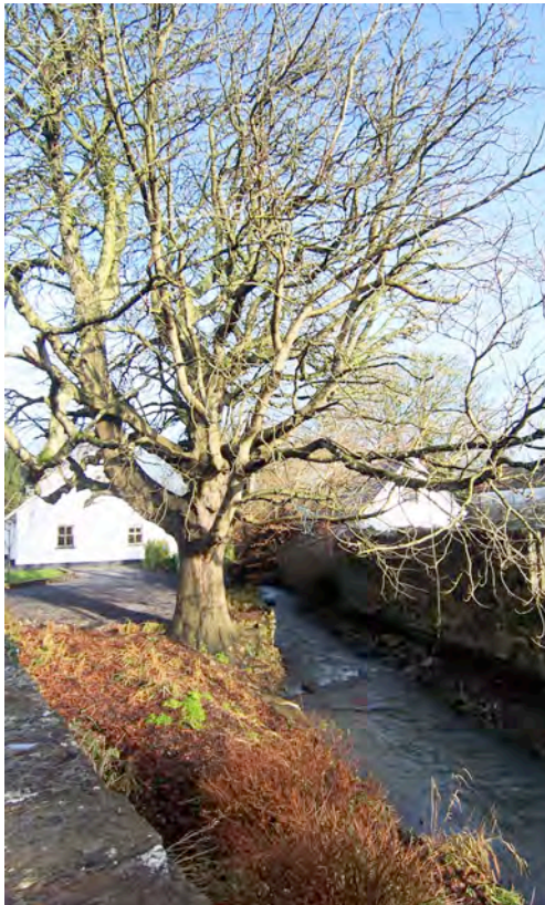
Left: River Daws runs through this village of Oldtown. As a green corridor, it will be protected and used as an amenity.