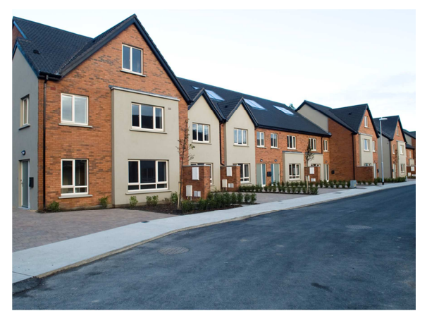
Social Housing acquired at Rossan Court, Dublin 15

During 2015 a total of 368 Social Housing units were delivered under a range of Housing Programmes including direct provision, Rental Accommodation Scheme, Long Term Leasing, Capital Assistance Scheme, Acquisitions and Pat V Acquisitions and the return of void properties during the period.