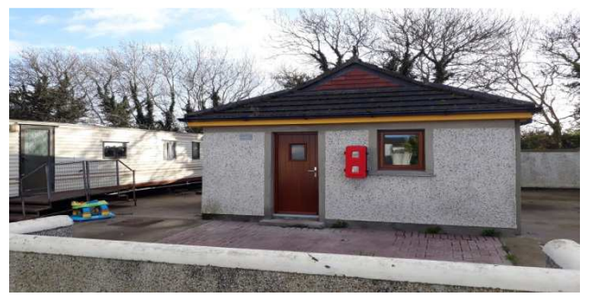
St Macullins Park