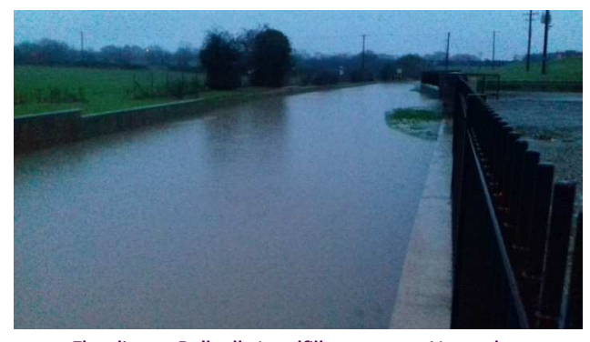
Flooding at Balleally Landfill entrance – November

Tender documents for construction were published on e-tenders issued in December 2017. This project will involve road realignment and drainage works designed to eliminate severe flooding at the entrance, replace surface water and leachate mains and will also involve relocation of facility buildings within the landfill site.