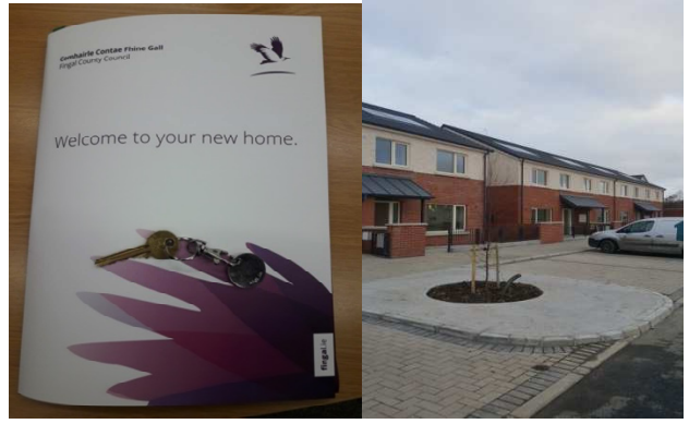
Wellview Terrace, Mulhuddart, Dublin 15

nominations for new homes in the North County and Dublin 15 areas.