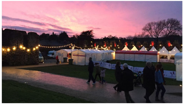
Swords Castle – Christmas Food Fayre

David Gilna, local playwright, performed his play "My Bedsit Window" in Swords Castle from December 4 - 9. This had upwards of 60 people in attendance every night. This is a clear example of the potential of the chapel in Swords Castle as an event space.