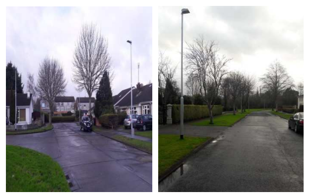
Cherry Avenue Swords

Column replacement works are finished in Cherry Avenue/Park Swords and Georgian Village Castleknock. Works consisted of the replacement of 39 & 65 end of life columns respectively complete with LED lanterns and supply circuit improvement.