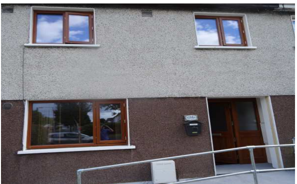
Example of Window & Door Replacement in Dublin 15

The Windows/Doors Replacement Programme for 2017 is substantially complete in Whitestown and Fortlawn Estate, Dublin 15. Installation has commenced in Sheepmore Estate, Dublin 15 and initial surveys have commenced in Dromheath Estate.