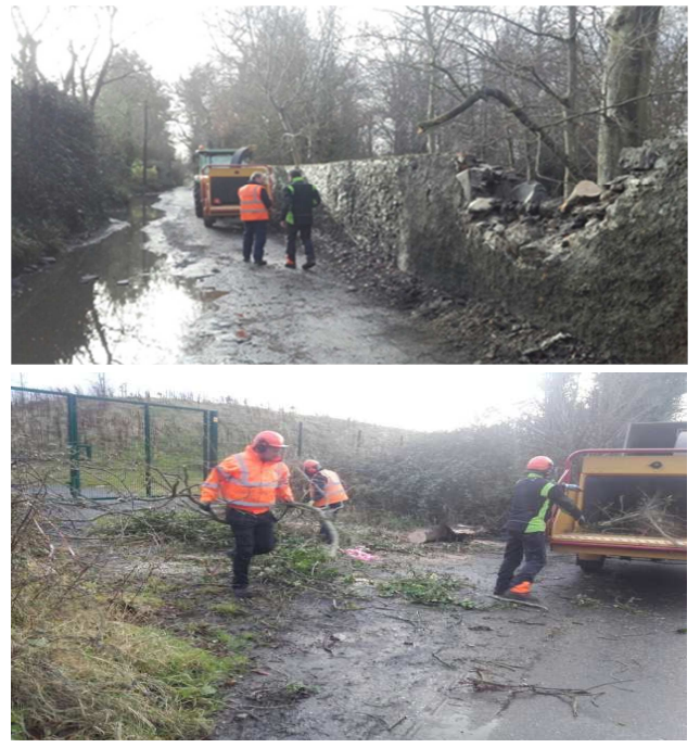
Tree Crew at Rugged Lane, Porterstown, Castleknock removing a fallen tree and debris

Depot staff responded promptly to reports of fallen trees throughout the County.