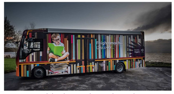
New Mobile Libraries - hitting the roads soon

Three new mobile library vans will be launched on January 23. A fourth van is on order with delivery expected at the end of March.