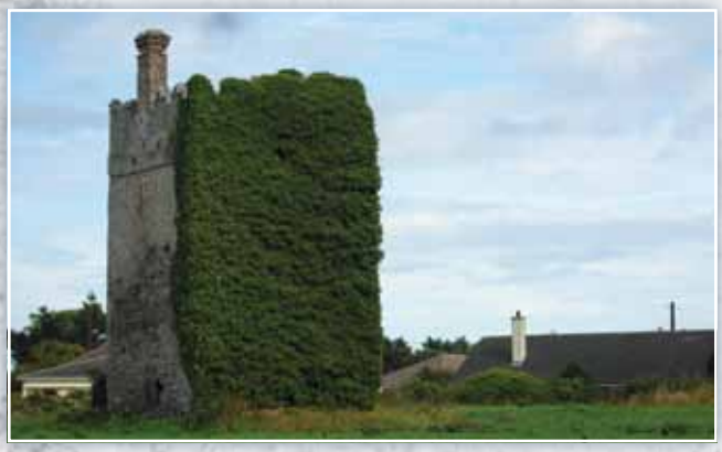
Stella's castle, Longstone Park estate, Portrane

Stella's Castle is a medieval tower house with 17th and 18th century additions including a brick chimney. In 1641 it was described as an old castle with thatched hall adjoining, a small barn, a stable, a cowhouse, and one garden plot. It is associated with Esther Johnson, otherwise known as Stella 'the truest most virtuous and valuable friend' of Jonathan Swift.