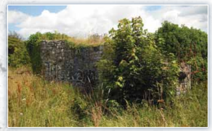
Rush Tower house, St Catherine's estate, Rush

Rush tower house probably dates to the 15th century and would originally have stood up to three storeys high with projecting stair turrets. It is one of just twelve surviving tower houses within Fingal. These fortified residences were built by gentry, rich farmers and urban merchants and it is estimated between 3000-7000 were built across the country between the 15th and early 17th centuries. Most would have been surrounded by a bawn area or courtyard, within which were ancillary buildings. The foremost example of a tower house is that of Dunsoghley built c.1450 by Thomas Plunkett, chief justice of the King's bench.