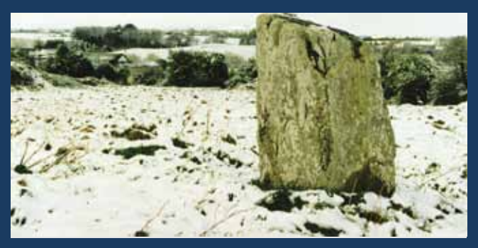
Balrothery Standing stone before development

The aim of Illustrating Fingal's Heritage is to gather the pictures, photographs and drawings of Fingal throughout its history into a central visual archive. As Field Monument Advisor I have visited almost all of the 600 archaeological monuments in Fingal and would love to see their context and setting as it may once have been.