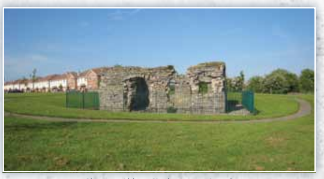
Glasmore Abbey, Cianlea estate, Swords

Known as Glasmore Abbey, this is a post medieval building with medieval stone insertions, within the open space of Cianlea estate. St Cronan was said to have founded a 7th century church at Glasmore Abbey. He met a violent end when the 'Northerners of Malahide' killed him and his fraternity. St Cronan's holy well is also nearby. However historical evidence indicates Glasmore Abbey was to the south of Swords. The 17th-18th century structure mysteriously does not appear to be either a church nor in the absence of a fireplace, a dwelling house.