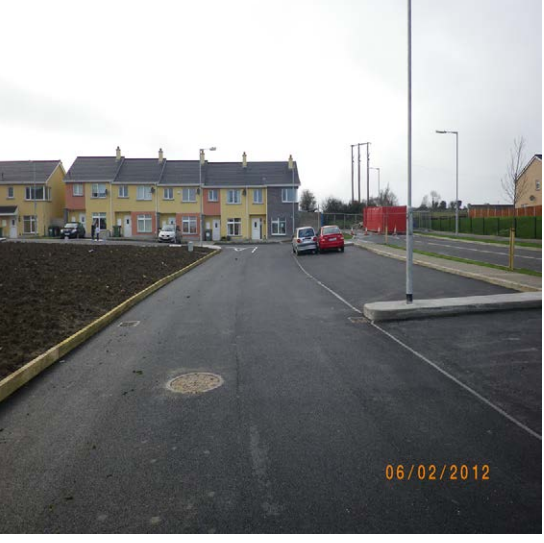
Taking in Charge: Bremore Pastures (Before and After)